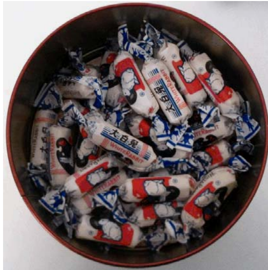
Presentation of White Rabbit Creamy Candy (loose)

White Rabbit Creamy Candy is an individually wrapped dairy confectionary which comes in bags displaying a large white rabbit.